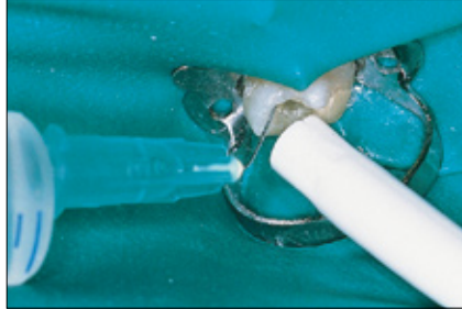
Patient optimally protected against aggressive rinsing agents