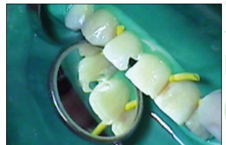
An alternative to clamps: Wedjets® stabilizing cord provide secure and gentle retention.