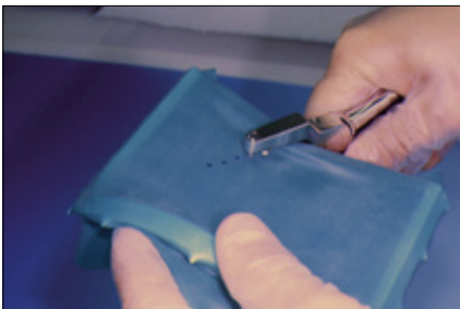
Stretch dental dam over a dam frame and punch out the pre-marked holes.