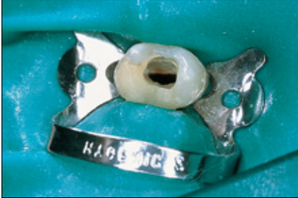
Excellent visibility and protection during root canal preparation