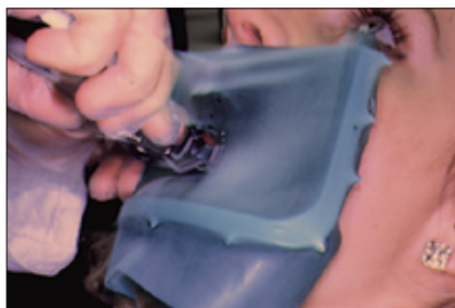
Position clamp with dental dam frame in one easy step.