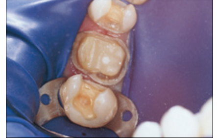
Use rubber dam even for subgingival preparations